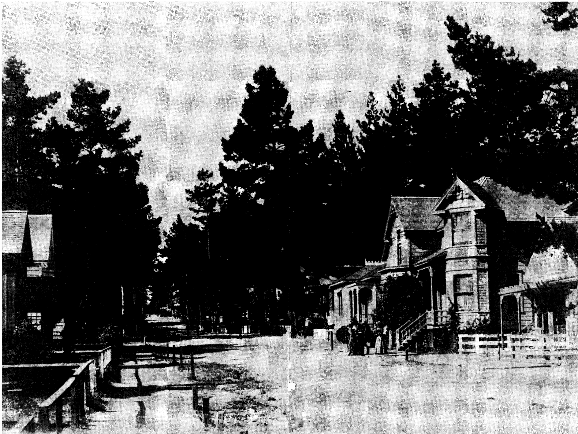
1890s view looking up Forest avenue. The prominent house on the right with the people out in front was built for Mrs. S. A. Virgin in 1887/88 at 136 Forest. The house was used as both a private residence and boarding house over the years. The house is still there with its front corner now enclosed.