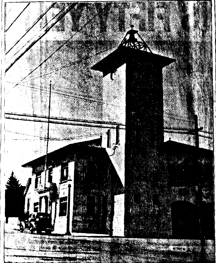
The historic old fire bell topping Pacific Grove's modern city hall was originally bought for $6, and was purchased in 1894, being moved to the present location in 1912. Before that time the firemen were called by a horn. The city has a volunteer department.